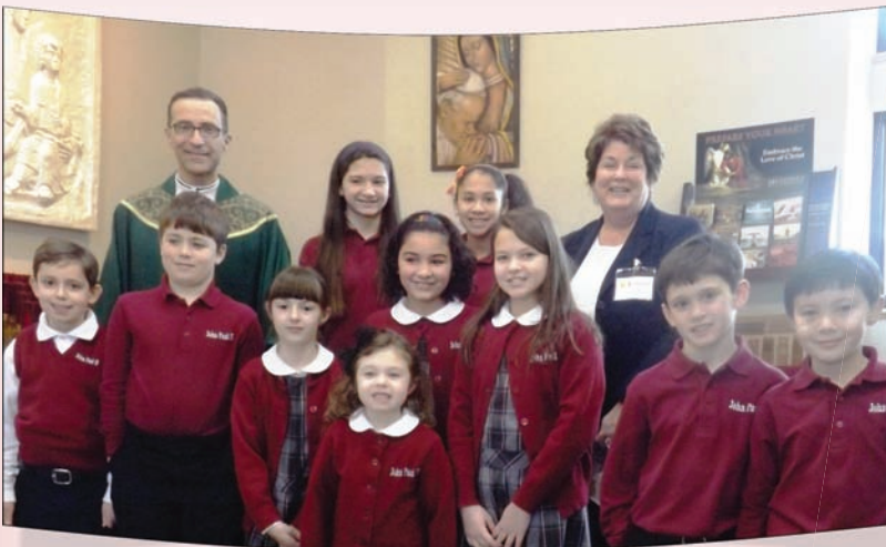
Students represented our school at both St. Lawrence Church and St. Luke Church for our Catholic School's Week opening Masses thanking our parishioners for their prayers and continued support. Hospitality followed with refreshments served at both sites.