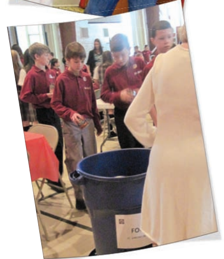
Student Council organized its annual "Pink Out" day in October to support breast cancer awareness and raised $250.00 for the National Breast Cancer Foundation. Students brought their gifts of canned goods for St. Vincent dePaul Society to our Happy Birthday Jesus party in December.