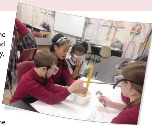
Younger students also visit the Science Center. Middle school students share their experiments, findings and projects with younger students periodically, which is mutually beneficial for both groups.